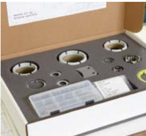
Custom Shadow Box Kits