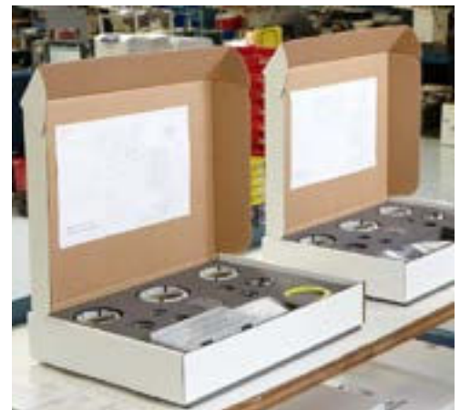
Dedicated Kit Staging and Storage Area