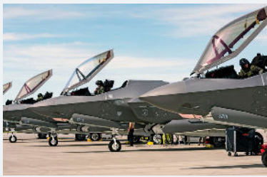
Defense & Space